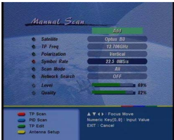
STEP 9 Go down to Symbol Rate and enter 2 2 5 0 0