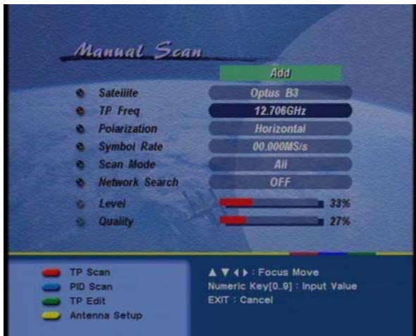
STEP 7 Select TP Freq and enter 1 2 7 0 6