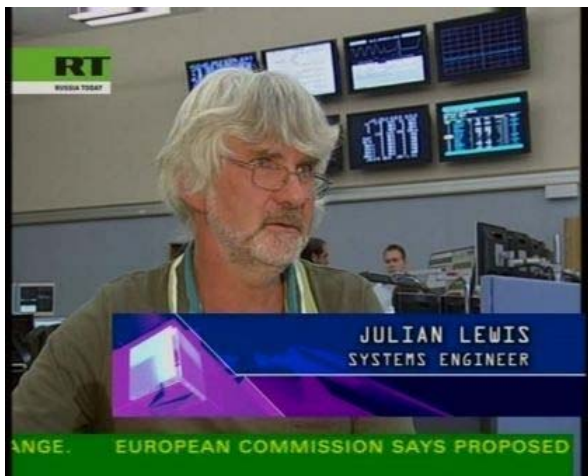
STEP 11 The STU will scan for the frequencies. Please scroll the channels to go to the right channel