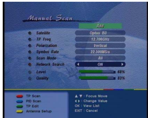
STEP 10 Go down Network Search and change it to "ON". Press the small Red button (above the arrow keys) on the Remote control