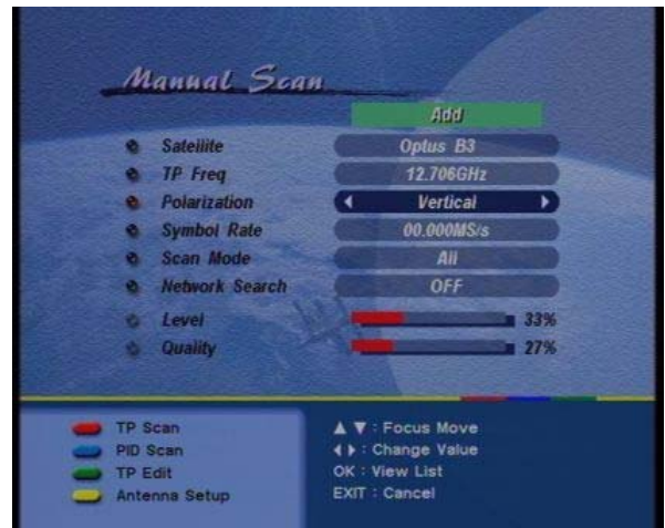
STEP 8 Go down to Polarization and change it to "Vertical"